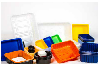
Large tray program

Our larger, fully-automatic sealing machines are suitable for medium sized and larger production companies. There are several add-on features that can be included to aid production, such as tray de-stackers, filling equipment, label printers and applicators, etc.