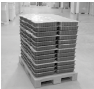
Full trays packed directly on pallet