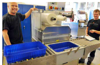
Food packaging experts